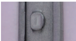
Assembled pocket filters clinching point